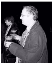
An ex-local makes up for lost time

If you are reading this in you friendly local, spare a thought for the regulars from the Apple Tree desperate to have their pub back so they can support it. In Community Pubs Week we also celebrated some successes and visited the Butt of Ale at Paul's Dene which was closed, application for demolition and development of housing was made and refused by the council. Again there was a community who wanted their pub back and got it and now use it.