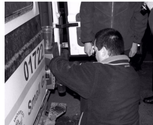
The 'bar' at the Apple Tree

when we try to raise awareness of the value of a community pub. In some areas the traditional pub providing a community focus and a place for neighbours to meet and mingle is under threat. As more pubs across the country close it seems that the community locals suffer in favour of the large theme pubs.