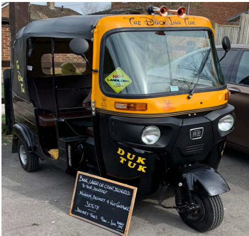
The mighty Duk Tuk

This year has without doubt been rather strange and, let us hope, unique. I do not think any of us want to see another like it. It has affected all of us in so many ways. I have missed most meeting up with friends in the pub and sharing the banter. But my problems are insignificant when compared to the licensees and brewers in our area who have lost income and many of their staff have unfortunately lost their income. They have not taken it lying down however and many of them continued to serve their local community providing takeaway and home deliveries of food and drink.