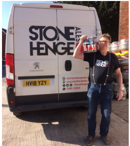
The Great Dane himself on home deliveries

At the northern edge of the district the Swan at Enford did sterling work as did the Wyndham Arms, Dinton and the Queen's Head, Broad Chalke. The same story could be found in the Heart of Wessex branch area with pubs such as the Walnut Tree, Mere, The Ship, West Stour and King's Arms, Marnhull providing takeaway lunches. The Benett Arms at Semley, featured in our August 2019 edition, changed hands just as the first lockdown came in but the new licensees, who live in Semley kept things going with takeaway beer and meals.