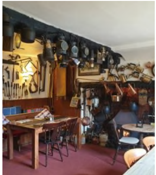
Just a few of the antique farm imple-

Those trying the vegetarian options were very suitably impressed; the Game Pie, a special that day, was amazing. The only problem on the day was our worthy chairman sitting on the framed certificate with the inevitable consequences, the frame being far more damaged than he was. He claimed it was an accident and felt duty bound to revisit the following week to re-present it in a new frame. We believe him – well, nearly .